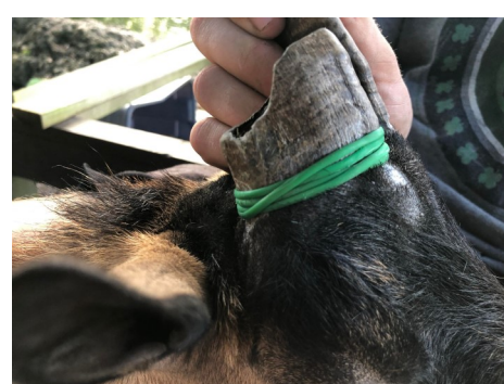
A progression of how to band a scurs.