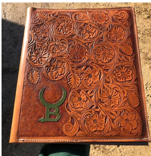
Custom Registration Binder