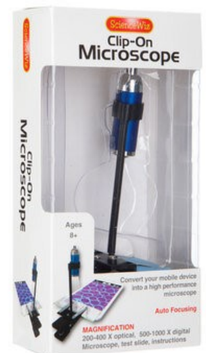
ScienceWiz Clip-On Microscope