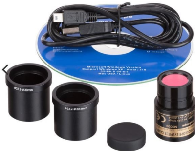
AMSCOPE Digital Eyepiece