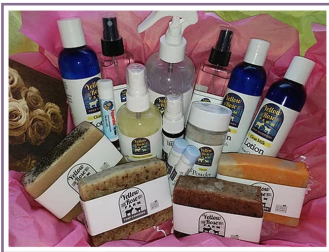
A basket of goat milk items of soaps and lotions would make a perfect hostess gift!