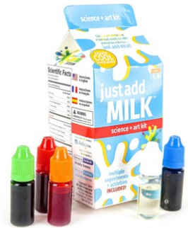
Milk Science Kit